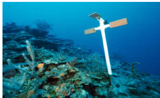
Fig. 1. Coral settlement array at 33 m in crystal clear water on the relatively luxuriant West Fore Reef, Discovery Bay, Jamaica. Array has two horizontal and two vertical terracotta tiles.

Over a two-year period, three acroporid spat settled during only one of the four